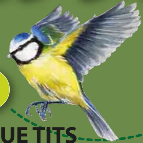
2 BLUE TITS