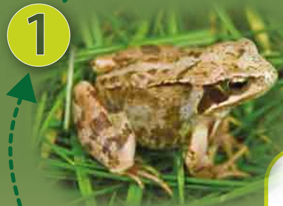
1 FROGS & TOADS