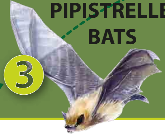
3 PIPISTRELLE BATS