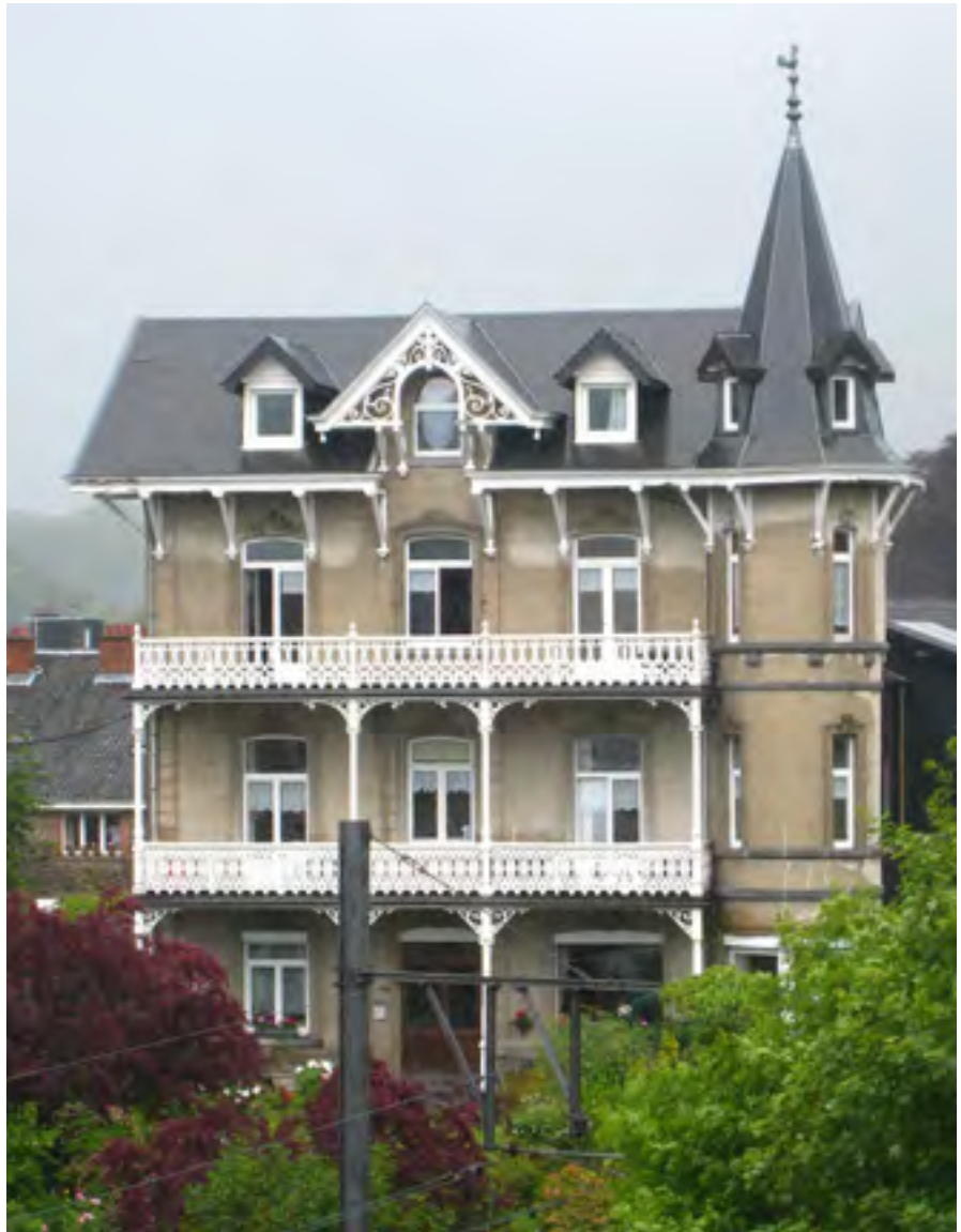
Traditional building features such as wide overhangs and hood mouldings were designed to keep water from entering the wall at weak points, keeping the walls dry and allowing them to resist driving rain.

Another apparently confusing observation is that rapid drying after flooding tends to fail: after a few weeks the surfaces are once again wet and covered with mould. This comes down to the difference between liquid and vapour movement, which causes drying to proceed in two stages. In the first stage, liquid-filled capillaries connect the water inside the material to the surface, so evaporation can quickly draw it out. Eventually, however, the speed of evaporation will exceed the speed that water can travel through the capillary, and the liquid stream will be broken. Across the break, water must travel as a vapour rather than a liquid, so immediately the drying rate plummets. This second stage of drying will continue until the water inside the material has moved around enough to once again establish a liquid 'flow