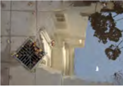
Water will not run uphill into a drain, and yet poorly-positioned drains are common.

water-vapour molecule to travel right through a permeable material of any thickness. Water vapour is most likely to be a problem if it forms enough condensation to drip or to run down as liquid. (Condensation on glass, for example, can lead to the decay or corrosion of window frames.)