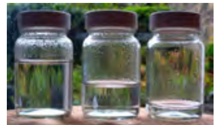
The air inside all three sealed bottles is saturated (as shown by the condensation) and this is independent of the water level. There are more than a 'vigintillion' ( 10^{20} ) water molecules in a single drop of water, so the reservoir needed to reach saturation is tiny.

Water vapour is often the principal topic raised by building physicists, but when it comes to understanding deterioration, liquid water is of infinitely greater importance. It is affected by gravity, so water from a leaking gutter will quickly find a path through the pores of the materials and flow down to collect at the base of the wall; this is a common cause of so-called 'rising damp'. In pores, however, gravity is only one of the possible forces driving movement.