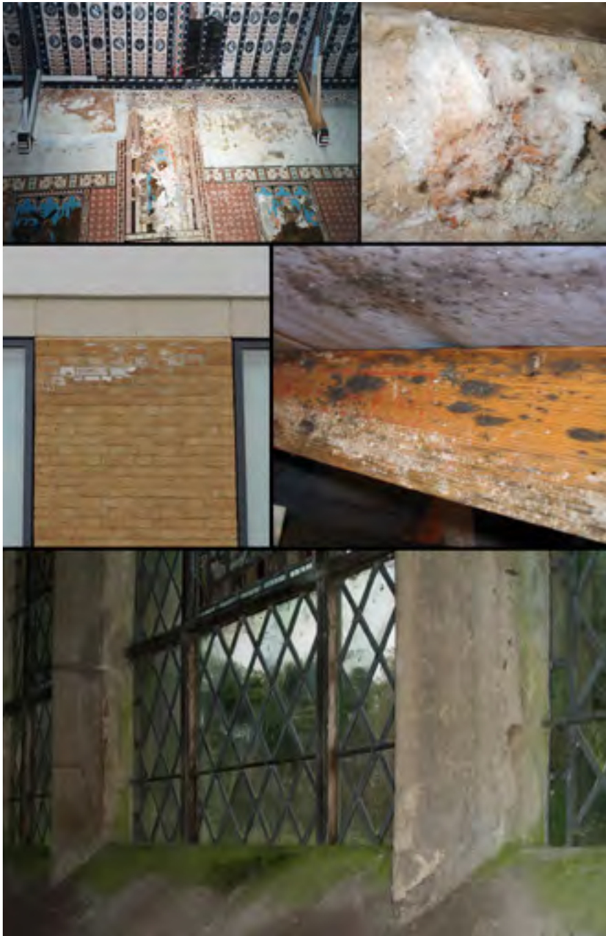
All the familiar water-driven deterioration (salt cycling, timber decay, corrosion) requires liquid water; even where water vapour is involved, the problems arise when it condenses.