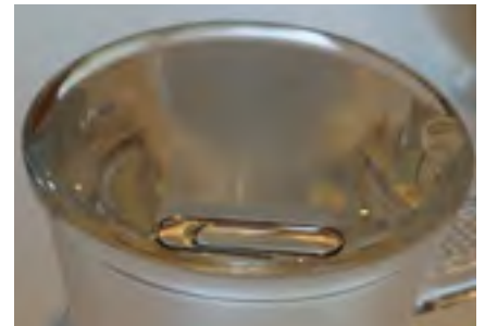
The structure of water molecules allows them to cling together strongly, forming a strong ‘meniscus’.

For materials scientists, ‘permeability’ is measured by packing a column with the material of interest, and passing the liquid or gas (its ‘mobile phase’) through under pressure. For building conservators, the mobile phase is always water (although it may well be mixed with salts and other contaminants), and the behaviour of single materials is of little interest: we are concerned