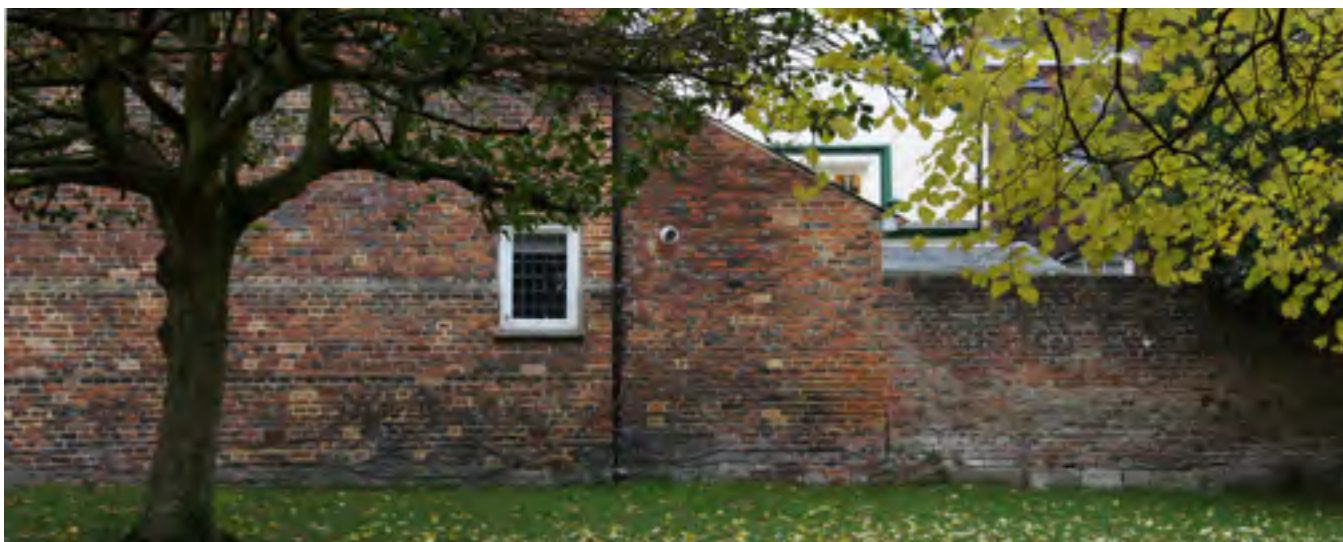
'Rising damp' is an excellent example of how many different sources of moisture can produce very similar symptoms. At the right, this wall shows the classic symptoms often attributed to capillary rise from groundwater: a zone of salt damage and staining, separating a dry area above from a wet area below. Closer examination shows that the majority of the wall is fine – which it would not be if groundwater were the issue – and that the source is in fact run-off from a glass roof behind, saturating the wall and percolating downwards. Other common causes of this damage pattern include splash-back and plumbing leaks.