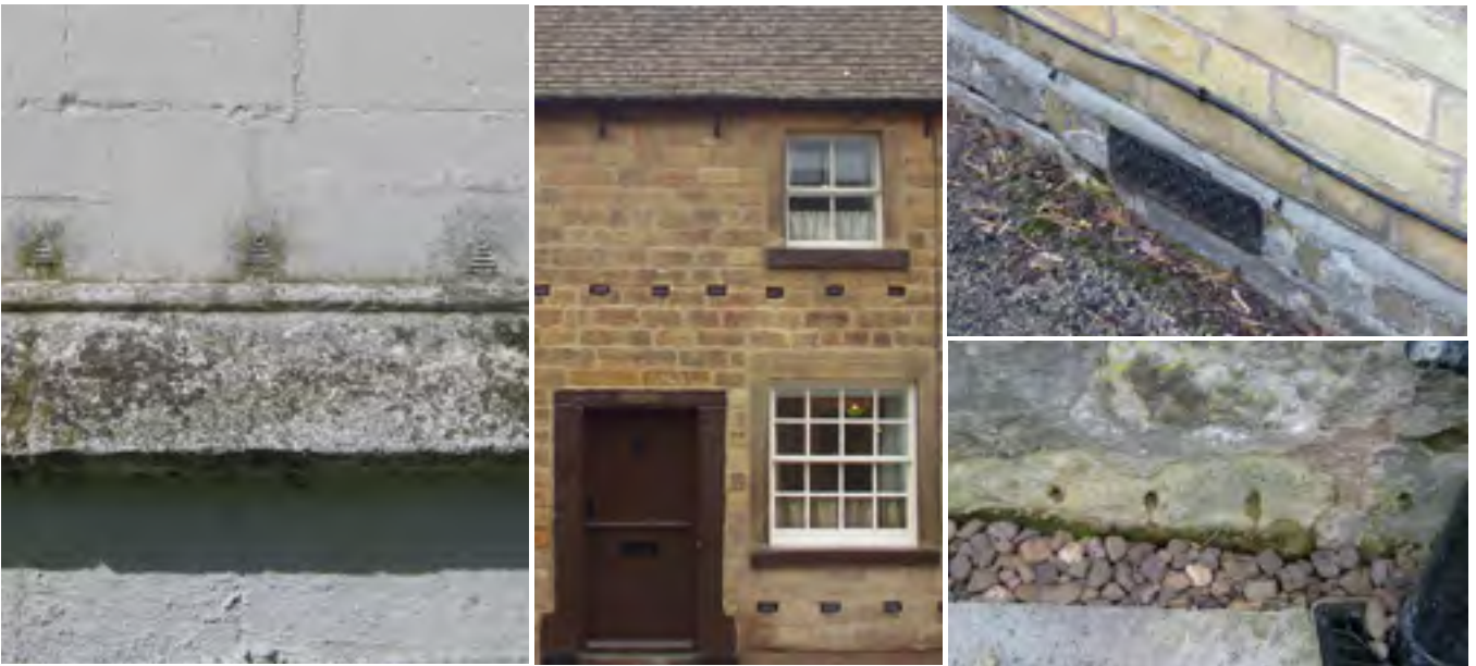
Failed remedial treatments are often based on wrong notions about the behaviour of water. The operation of Knapen tubes, for example, is based on the idea that humid air is heavy and so will fall. In reality, humid air rises.

T HE CRITICAL links between water and almost every form of building deterioration do not need repeating here, nor does the fact that porous materials interact closely with moisture. On the other hand – as the various claims for miracle remedial products make clear – the mechanisms by which water moves into and through building materials are not so well understood.