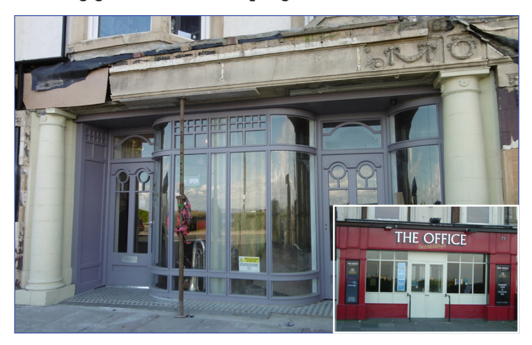
240-241 Marine Road Central - the former 'Office' building.

The THI has been supporting the refurbishment of this imposing building during its conversion to retail units on the ground floor and private accommodation to the upper floors.