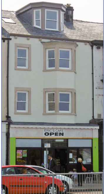
245 Marine Road Central (above, before and in progress)

Many of the buildings along this stretch of the promenade were once private dwellings, with traditional pitched roofs and bay windows. Over time some of these buildings have changed considerably, including at 245 Marine Road Central where 'Eric's Café' occupies the ground floor.