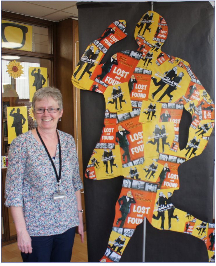
Morecambe Library's display featured a lifesize cardboard cut out