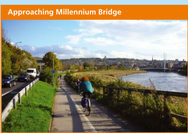
Approaching Millennium Bridge