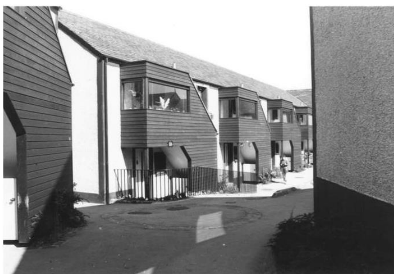
c.1980 photo of Bath Mill development

The Bath Mill Conservation Area covers the site of the former cotton mill of the same name, which was demolished in 1974. The area now comprises an innovative 1970s housing development designed by the internationally significant firm BDP who, at the time, were based in Preston and growing in prominence. The housing development is a stark contrast to the fortuitous character of Lancaster's city centre and suburbs. The development adopts strict principles of pedestrian-vehicular segregation, with dwellings facing inward onto colour-coded squares furnished with varied landscaping.